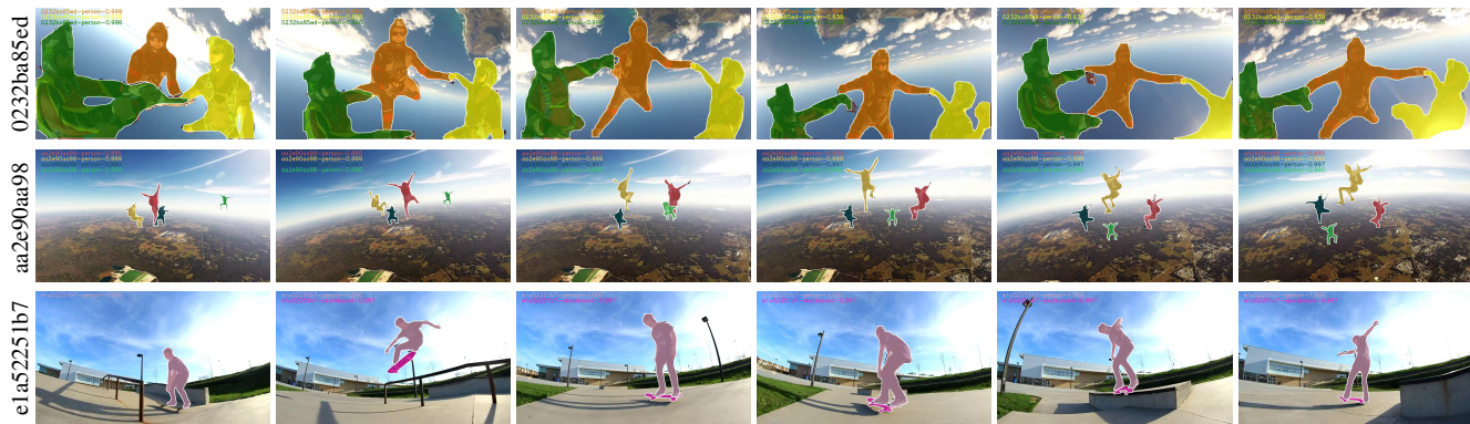
Figure 3: Qualitative results of our method on videos in Youtube-VIS.

task, and highlight contributions from a set of very practical techniques. Our overall system achieves state-of-the-art performance on the challenging data set of YouTube-VIS.